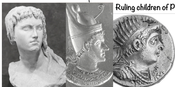
Cleopatra II Ptolemy VI Ptolemy VIII

Ruling children of Ptolemy V & Cleopatra I, vs. Antiochus IV