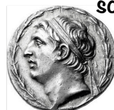
Demetrius I sent to Rome as hostage. Antiochus IV free. Later escapes, kills cousin Antiochus V, takes throne 162BC.