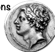
Antiochus IV hostage/Rome, Athens, free. R 175-164BC returns from Egypt angry 168BC